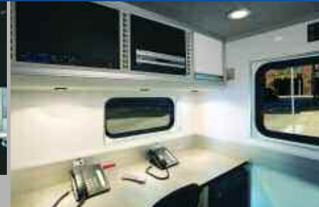
Workstations with computer network and telephone system hook-ups